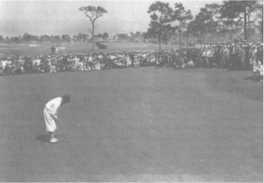
Bobby Jones putting at Pasadena.

the par-four hole in regulation but were far from the flag; Jones was some 60 feet away, while Hagen was a few feet closer. Moreover, both men would have to negotiate a “knob” located just in front of the cup. Jones putted first, and his ball died very close to the hole, guaranteeing at least a halve and possibly a win if Hagen three-putted. But Hagen neither three-putted nor two-putted. Rather, he sank the long putt for a birdie three to go nine up. 14