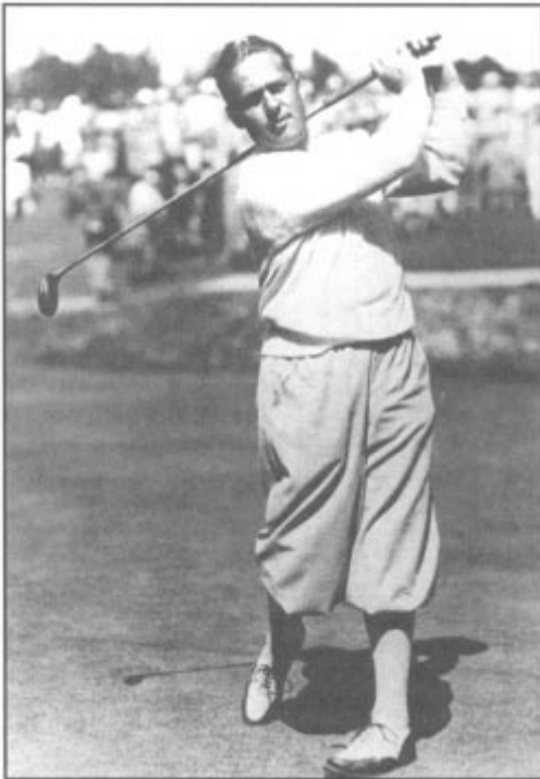
Bobby Jones.

“Everybody was claiming Jones was the greatest golfer in the world and saying I was second best,” Hagen recalled. “It rankled me a bit, so I got a friend