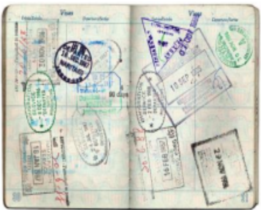
You have received your acceptance letter to Mississippi College and your Certificate of Eligibility of Nonimmigrant Visa. Now what?