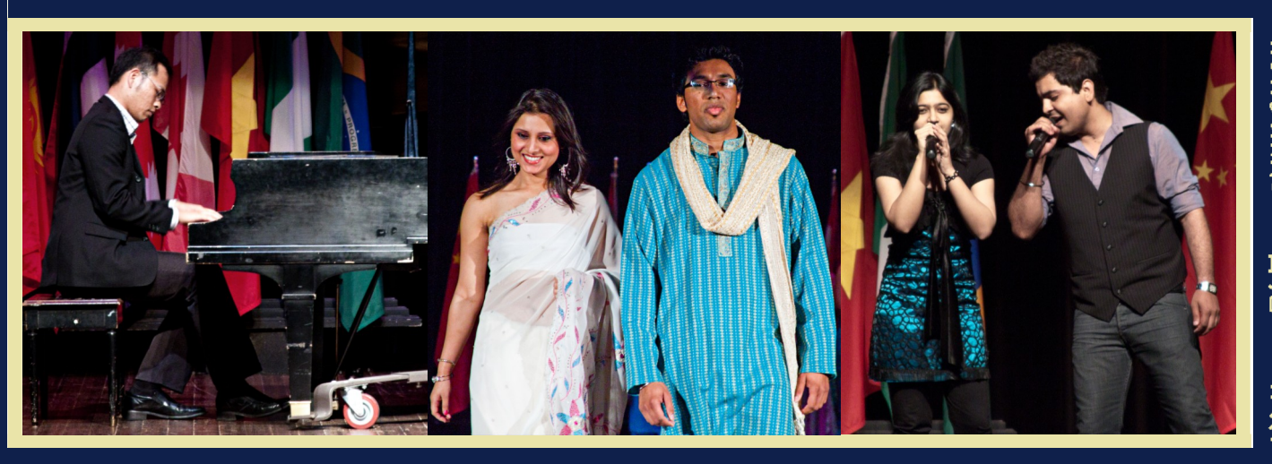
• नेपाल • NAÍJÍRÍÀ • Россия • المملكة العربية السعودية Кыргызстан