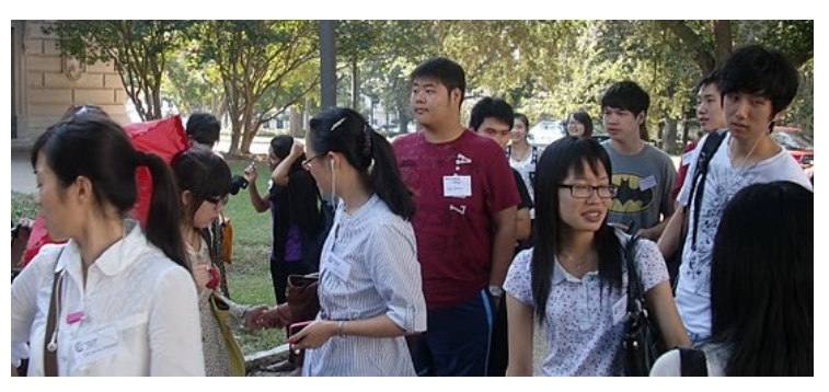
IEP students enjoy a field trip to downtown Jackson where they toured the Mississippi State Capitol and Old Capitol Museum

In addition to their regular course work, IEP students are also required to participate in Conversation Partners, Writing Partners (sponsored by MC's own Writing Center), and field