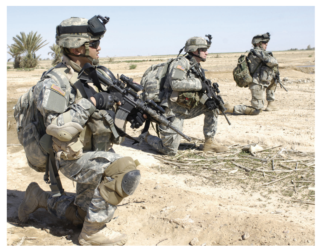
Soldiers on patrol